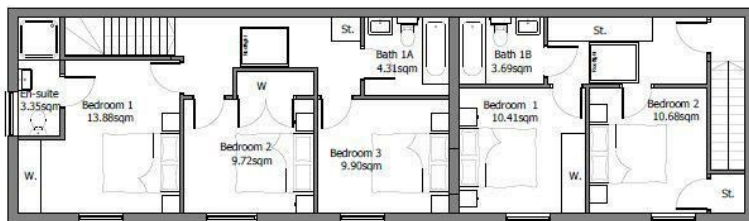
First Floor Plan 1:100